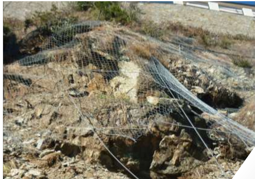
Mild Steel Mesh/Gabion Mesh F_t \geq 450 \text{ N/mm}^2