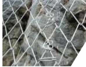
High Tensile Steel Wire Mesh