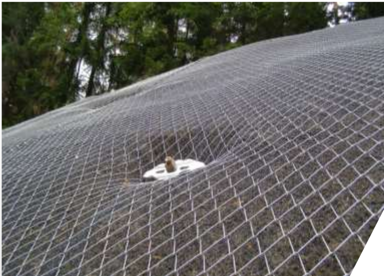
High Tensile Steel Wire Mesh F_t \geq 1770 \text{ N/mm}^2

Puncturing resistance of high tensile steel wire mesh made of 4mm dia can go upto as high as 370 KN