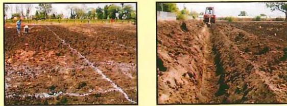
Fig 1: Layout Designing & Trench preparation