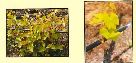
Fig 2: Rootstock in Main Field & In situ Grafting