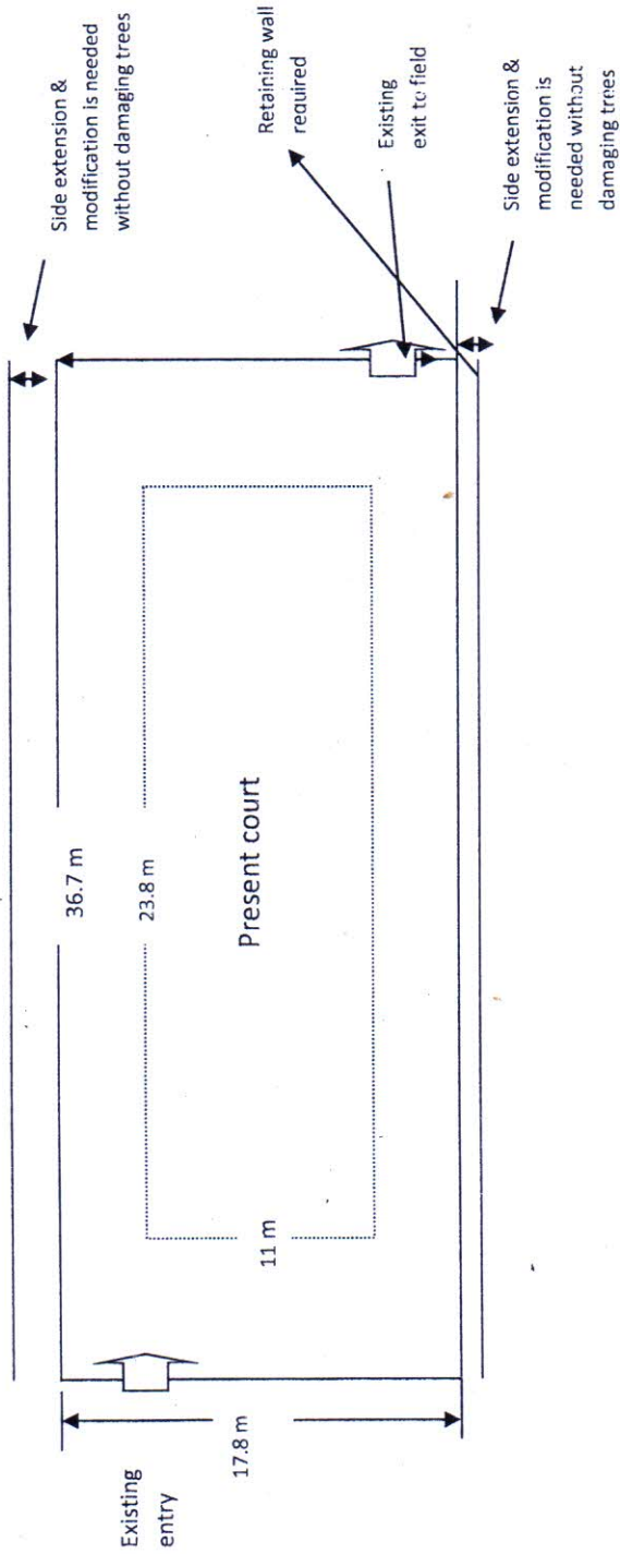
Repair & modification of AGTP Tennis Court